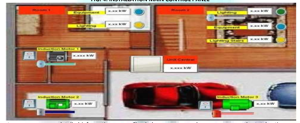
FIG. 4: INSTALLATION MAIN CONTROL PANEL

The test bed installation represents a residential house which control display is presented in Fig. 4. This is the main menu where one can have a general view of the installation and some information about the loads.