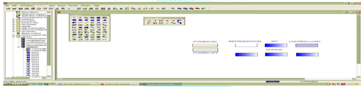
FIG. 7: REAL TIME STATUS OF HOME DEVICES ON SCADA

We studied the three types of SCADA like iFIX, InTouch and ICONICS. After comparatively study we decide to use iFIX SCADA software. Because iFIX SCADA is supports different PLC, it does not required particular drivers for communication with PLC. For SCADA use the ICONIC software in which we see the real time information of proposed system even if we observe fault at which place in system occur means monitoring whole system operation at control room. Real time status of field devices shows in fig. 7.