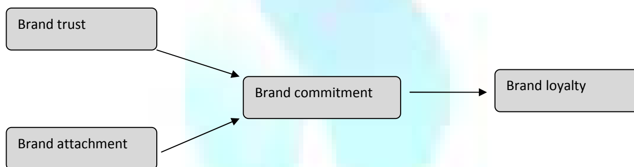
FIGURE 1: PROPOSED MODEL

H3: Brand attachment has a significant positive impact on brand commitment.