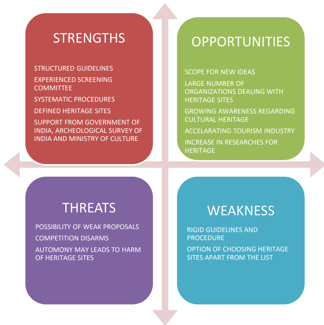
CHART 2: SWOT ANALYSIS OF ADOPT A HERITAGE PROJECT

Well the pace at which the project is moving, progress is the right word to represent its present state of affairs. Till now 57 expressions of interest have been received, all from reputed and efficient organizations and the proposals were very impressive and appreciable. Out of these 57 responses only 7 organizations have been selected as Monument Mitras, the reason is obvious, very focused and strict procedure of the screening committee for the selection of well deserved Monument Mitras, these organizations are