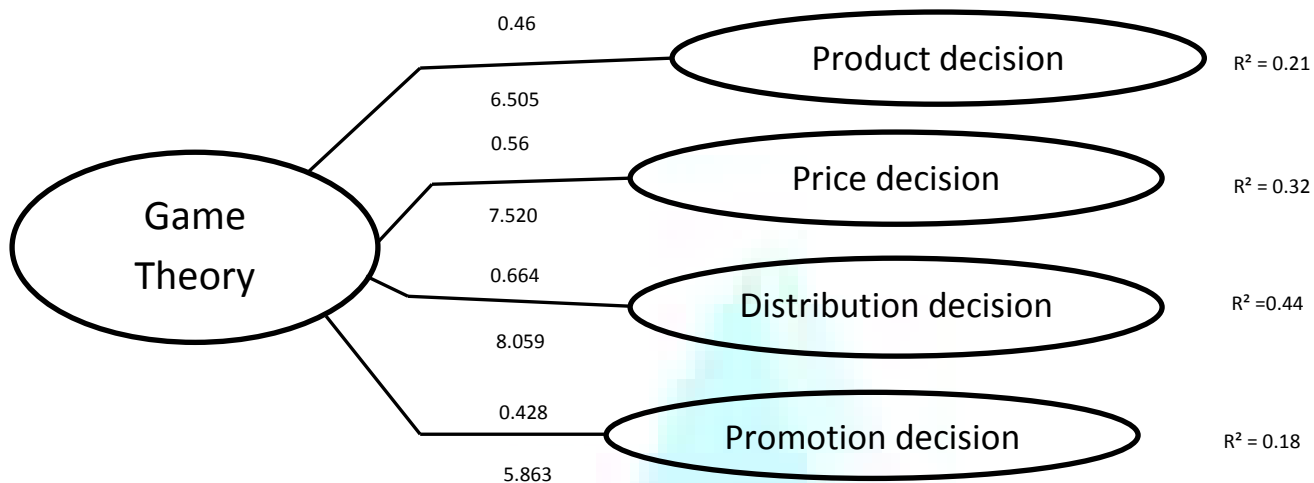
FIGURE 2: FINAL MODEL INVOLVING THE POLITICAL MARKETING MIX ELEMENTS

Chi-Square = 735.790, df = 271 CF1 = 0.975; TL1 = 0.970 IF1 = 0.975; RMSEA = 0.076