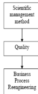
FIG. 3: EVALUATION OF BPR

The key to Taylor's advances in organizational thinking was that the scientific method should be used to develop a "best way." The "best way" must always be acknowledged to be relative to the available tools and labour skills for performing business activities. They will change over time, so business processes must continuously be reengineered to produce a new "best way." What shouldn't change over time, however, is use of the scientific method to find it. The necessity to continually reengineer appears to be one of the areas where Taylor's principles have been misapplied [Soliman, (1998)].