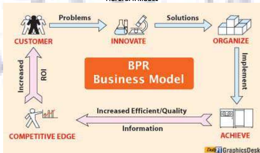
FIG. 2: BPR MODEL

Business process reengineering: Reengineering results in companies being re-modeled: Projects can be expensive in scope. The starting point and finishing point of a targeted process are usually in different departments, making it cross-functional. Areas involved are those which have an impact on, or are impacted by, the process being reengineered. A reengineering effort supports the company's Business Plan. The focus is to achieve benefits in support of mid-term targets which are three to four years in the future. The results of a successful project contribute to corporate performance and should be tracked to the bottom line within a year of implementation.